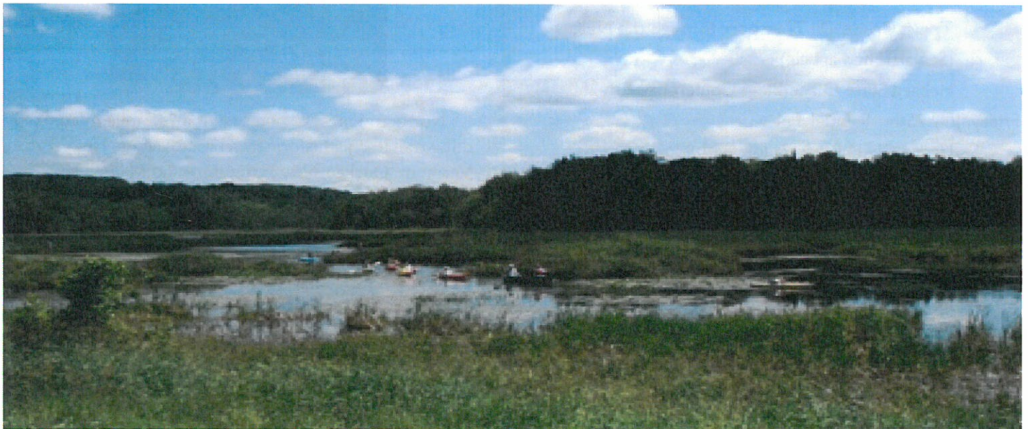
Eagle Point paddle Summer 2013

MWA will be contracting with Stone Environmental Inc. of Montpelier to conduct the actual field work and study beginning later this spring. In the study, stormwater outfalls will be evaluated during dry weather to determine if there is water flowing. For those outfalls that have a flow, water quality tests will be performed to determine if the source of water is wastewater or from natural sources such as groundwater. Based on those assessments, advanced investigations may be performed in order to locate and identify the source of contamination. Many of the identified illicit discharges are anticipated to require low cost solutions, and if more costly infrastructure projects are needed to resolve discharges identified through the study, MWA will be working with the municipalities to secure funding. The grant will be completed by May of 2015. MWA is appreciative of the support shown by town officials and select boards for the study and for their cooperation in working to improve water quality in the watershed.