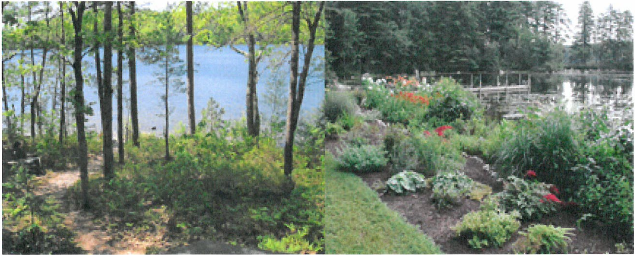
Images of Sebago (Maine) lakescaping projects from the Portland Water District ( pwd.org ).